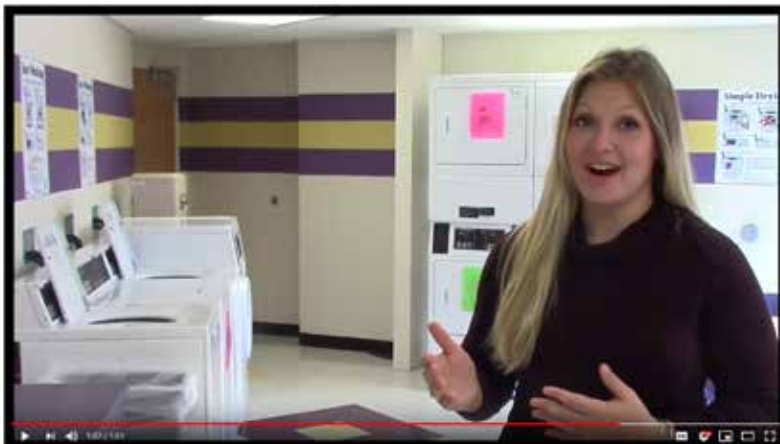
McReynolds Hall Tour