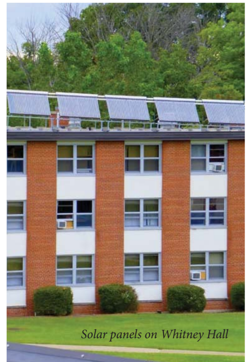
Solar panels on Whitney Hall