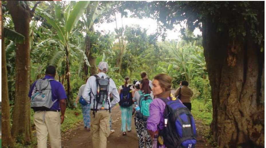
TANZANIA, MAY 2015