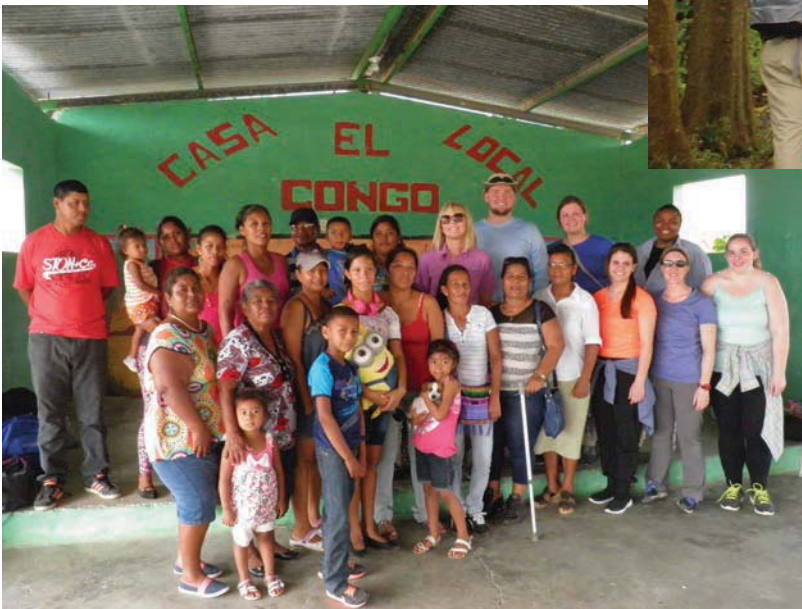
PANAMA, MARCH 2016