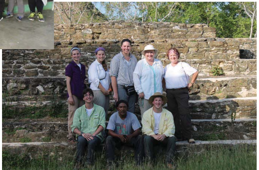
BELIZE, DECEMBER 2015