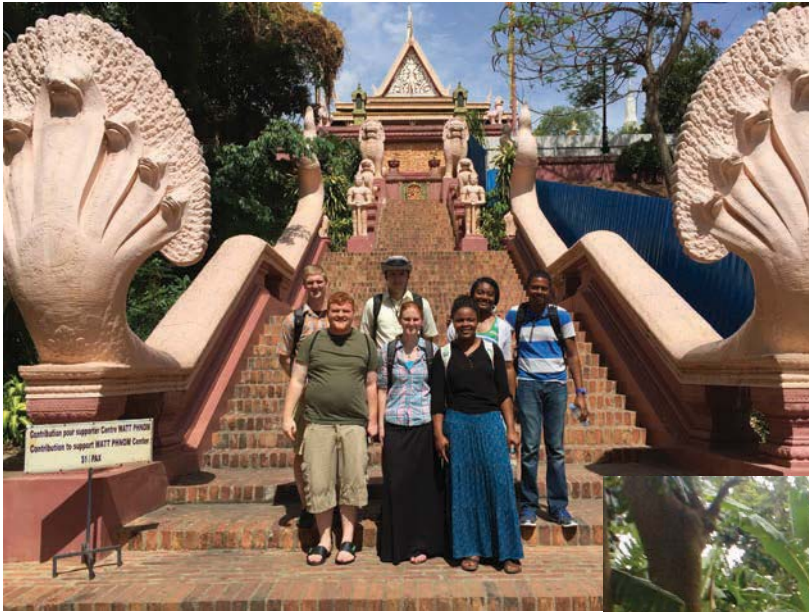
CAMBODIA, MAY 2015