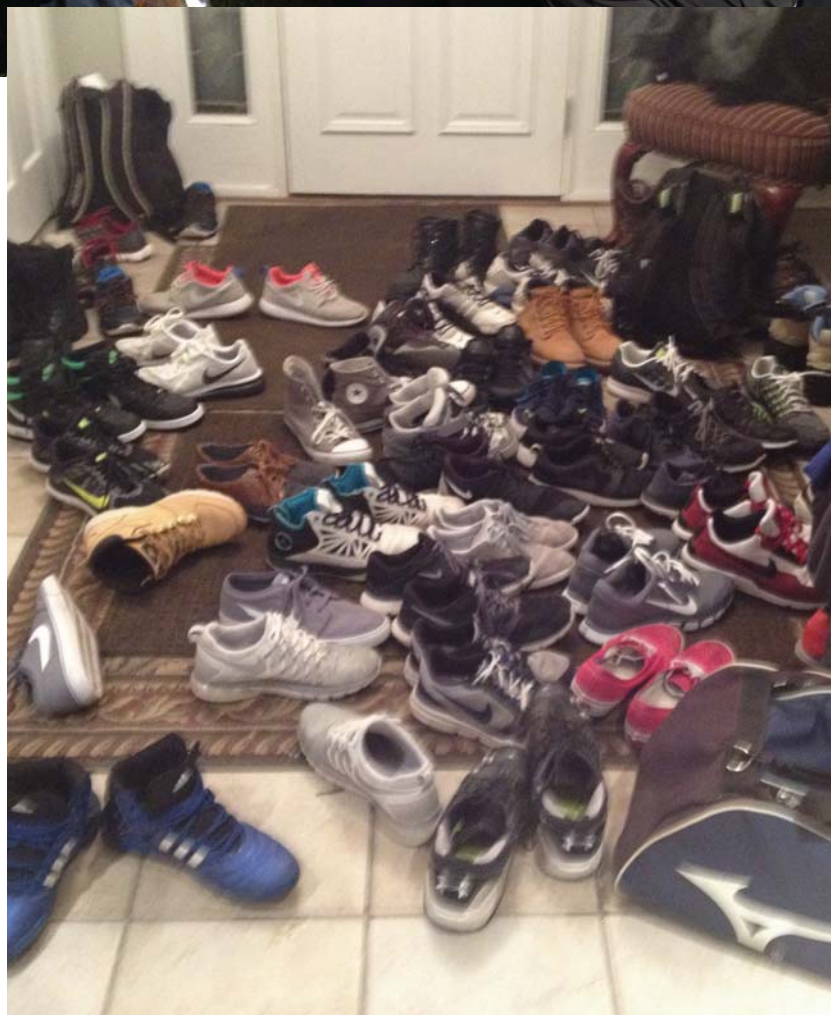
A not-uncommon sight at the President’s home – students’ shoes in the entry hall when visiting for study tables, dinners, movie nights or playing ping pong.