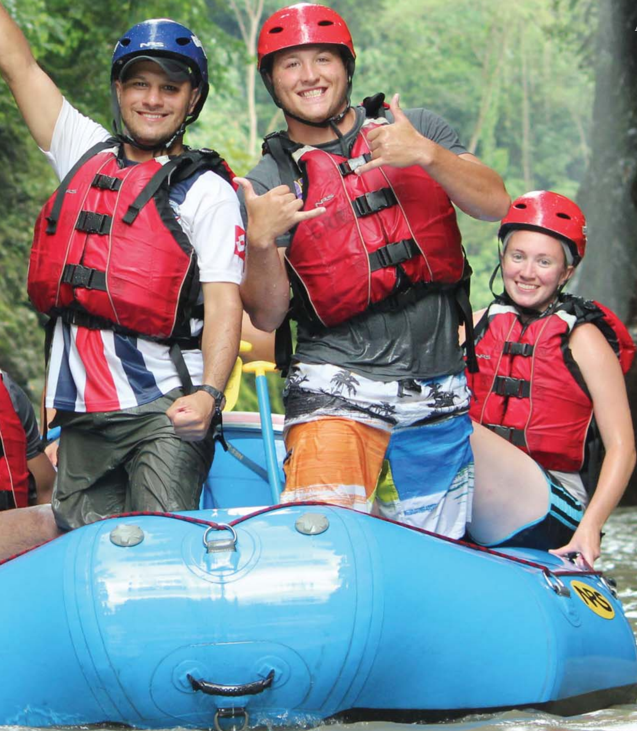
Students whitewater rafting during a trip to Costa Rica in 2014.